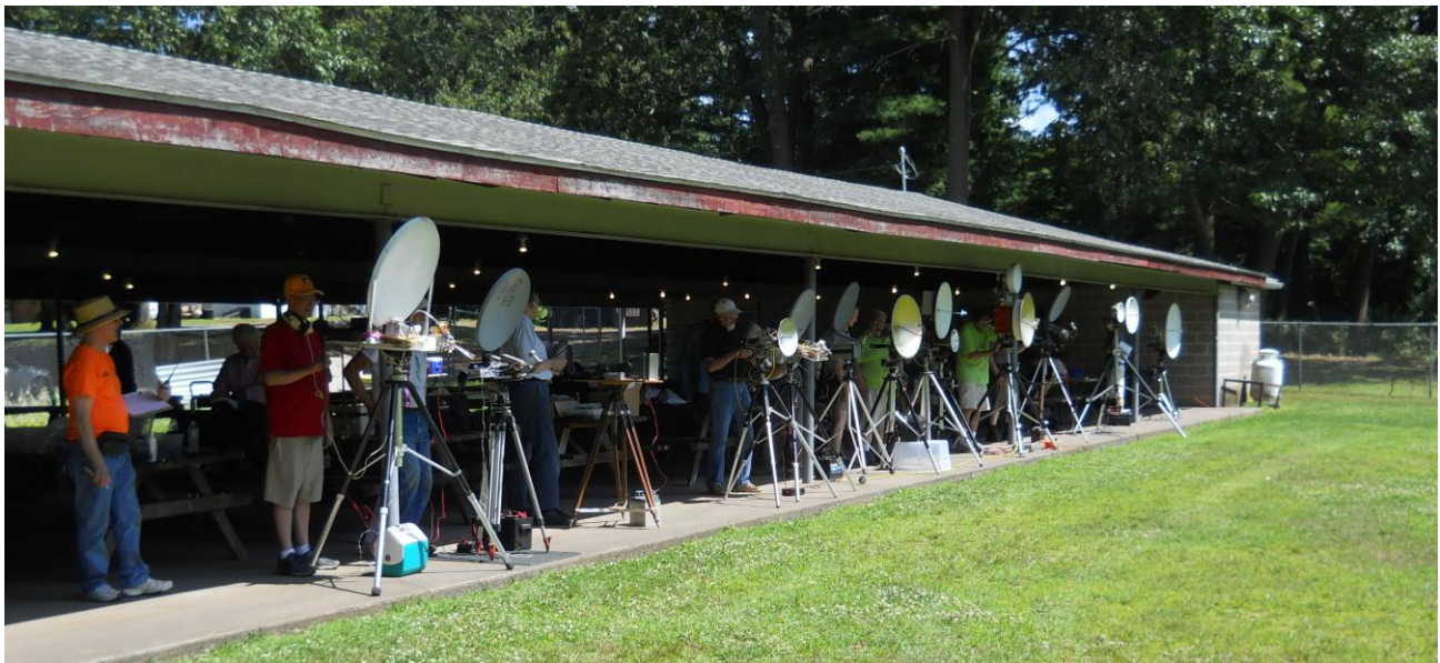
The Lineup – All the usual suspects were present.

We also check relative ERP, transmitting one at a time and recording the relative power received at the distant point using a spectrum analyzer.