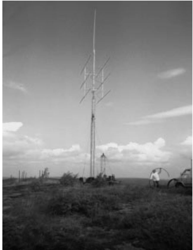
KA1QFE AT NC11 CONTEST SIGHT

CALL K9PW W1VT N8KWX N0JK GRID EN52 FN33 EN62 EM18 CLAS QRP QRP QRP QRP 50 72/20 69/19 35/13 0/0 144 166/38 138/25 75/24 42/25 222 67/23 75/16 29/13 0/0 432 99/31 95/19 42/14 30/20 903 31/17 16/9 2/2 0/0 1.2 54/20 27/13 9/4 12/9 2.3 10/7 13/8 0/0 0/0 3.4 10/6 8/5 0/0 0/0 5.7 8/6 6/3 0/0 0/0 10G 7/5 7/5 0/0 0/0 24G 2/2 0/0 0/0 0/0 LAS 1/1 0/0 2/2 0/0 TOT 527/176 454/122 194/72 138/54 SCOR 171952 99064 21096 7452 CALL K9PW W1VT N8KWX N0JK