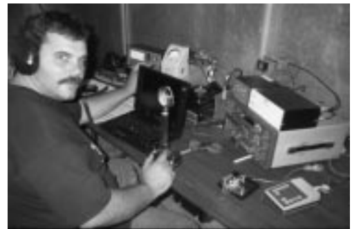
N1MUW AT NC11 CONTEST SIGHT

ROVERS Score Totals Grids Bands AB4CR/R 253445 708/159 14 ABCD9EFGIJ Ops AB4CR, W8ULC ND3F/R 126228 656/108 8 ABCD9E W2FU/R 100000 ??/? ? ? W3EKT/R 96051 638/101 4 ABCD9E Ops W3EKT, K3IXD K7XC/R 70000 ?/98 18 ABCD? N1MJD/R 50869 414/80 11 ABCD Ops N1MJD, N1JEZ KA2CKI/R 48128 353/87 7 ABCD9E Ops KA2CKI, KV2X KF9US/R 37926 298/78 8 ABCDE N3LJK/R 35422 266/89 4 ABCD9EF Ops N3LJK, K3YWY W9FX/R 34780 270/80 14 ABCDE Ops W9FX, N9BJG N6DN/R 16785 373/38 7 ABCD WB9SNR/R 11760 108/50 6 BCD9EFGHI N1MU/R 3406 72/20 6 BD9EFGH