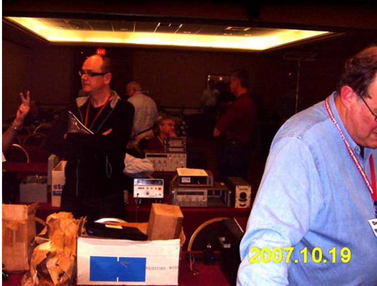
The busy flea market.