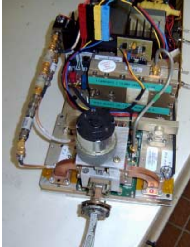
Dick, WB6DNX's 24 GHz Endwave SDH/ Verticom rig shown at the July SBMS meeting.