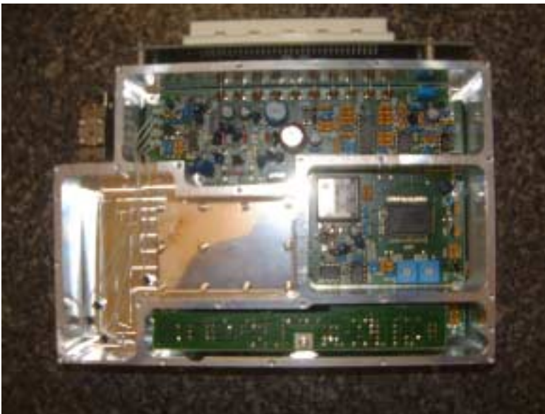
The NEC up converter module.