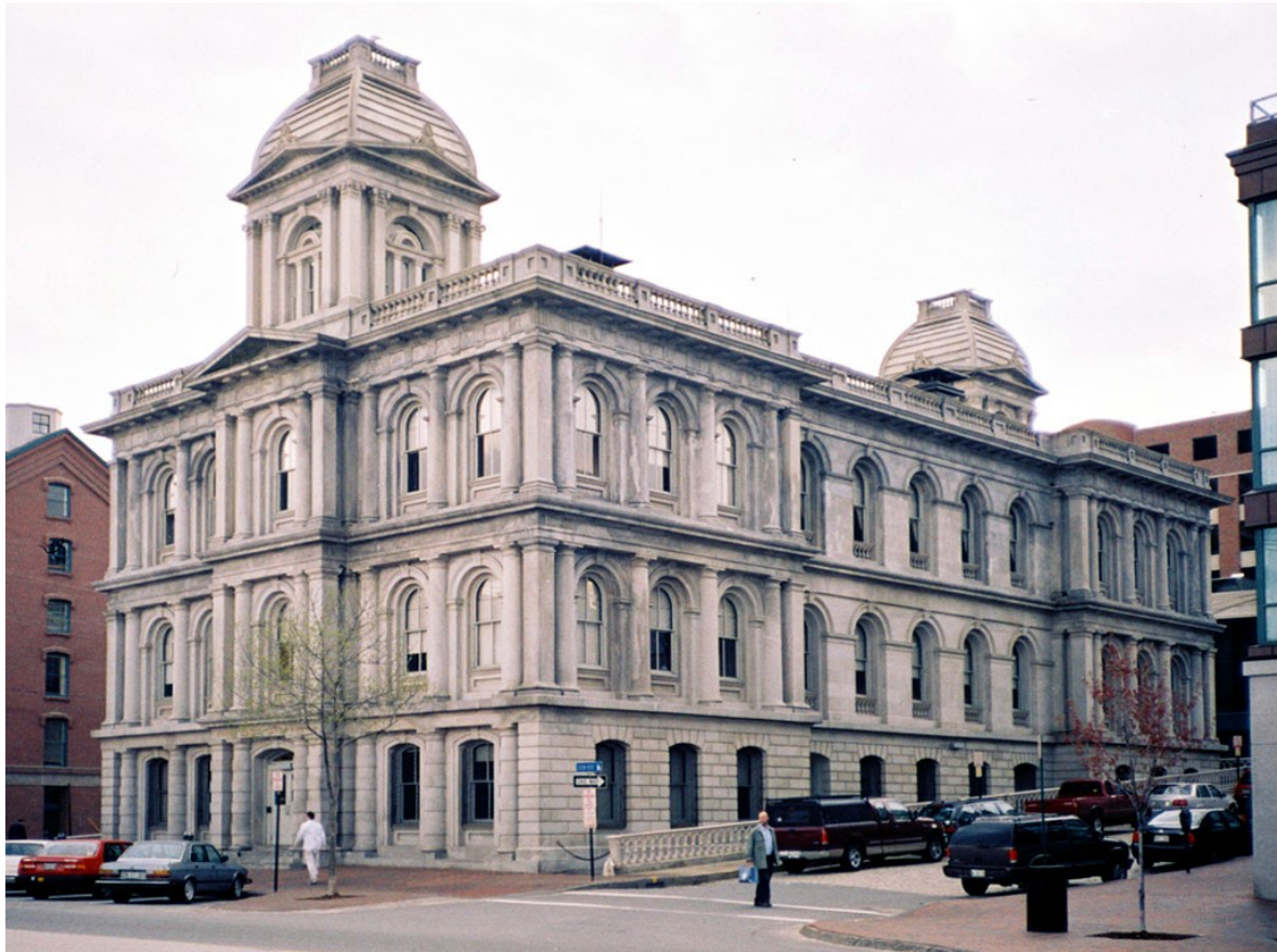
US Customs House Portland Maine